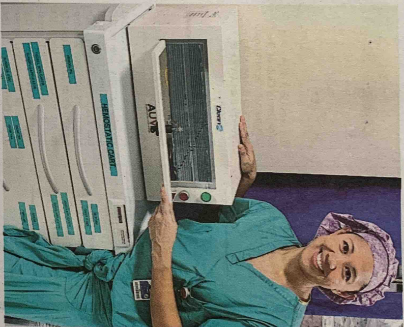
A staff member at AdventHealth Orlando uses a Cleanms UV system, purchased by a grant from the Rotary Club umbrella, to sanitize equipment at the hospital.

"On behalf of over 1,700 Rotary members, thank you AdventHealth for the work you continue doing and help you provide our local hospitals," he said. "We are always pleased to be able to work with